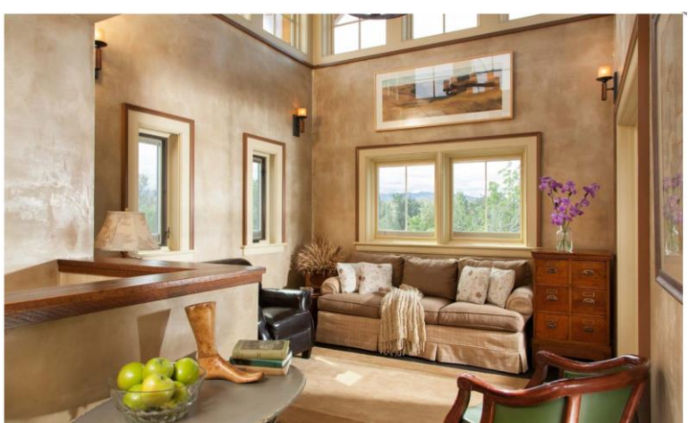
The exquisite Hayloft Suite at Abeja in Walla Walla.