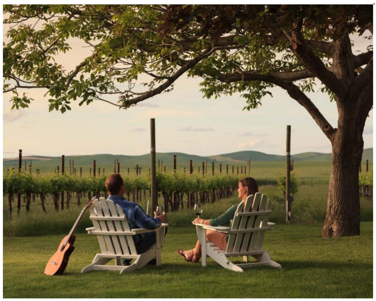
Surrounding Abeja Winery and Inn are thirty-eight acres of gardens, lawns, creeks, and vineyards for guests to enjoy.

Abeja describes itself as "an adult get-a-way with a working winery." As a result, children under the age of 13 are not encouraged, and only one option on the estate is pet-friendly. Rates range from $325 to $1,500 per night. www.abeja.net