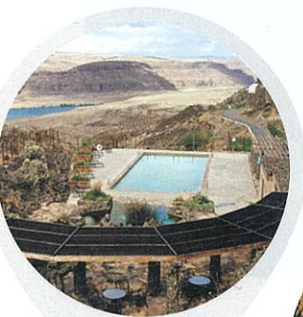
Cave B Inn and Spa

It's hard to guarantee a sunny vacation in the Pacific Northwest—this ain't Baja. But the east side of Washington and Oregon, along with Idaho, have a higher likelihood of a few (chilly) rays, and all offer Covid-safe retreats within a day's drive.