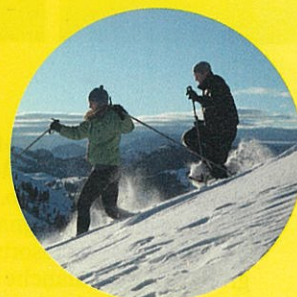
Sun Mountain Lodge